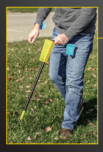
Clear audio alerts in the presence of underground wires and solenoid valves.

Hands-free operation with alligator clips to send tone through electrical systems.